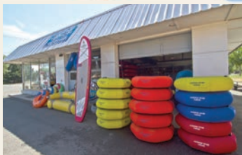
Located across from Bozeman High School on Main Street.